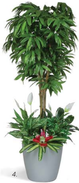
Mango with base planting